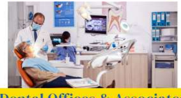
Dental Offices & Associates